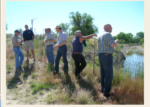
(Members learn about the North Platte River Systems on annual Basin Tour)