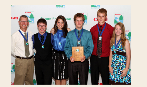
(The 2011 Nebraska Envirothon Team from Superior High School placed 15th at the Canon Envirothon in New Brunswick.)

These programs are a great opportunity to recognize Nebraska's youth for their interest and hard work in helping to protect our natural resources.