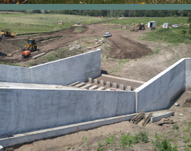
Above: In December 2020, work was completed on the Upper Big Nemaha 25C dam concrete spillway.