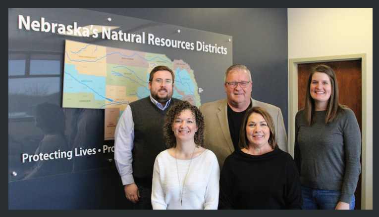
NARD staff began working in the new office building January 2021.

The NARD staff looks at these challenges as opportunities to learn and grow. The COVID comeback in 2021 adds to the challenges. However, optimism will win out.