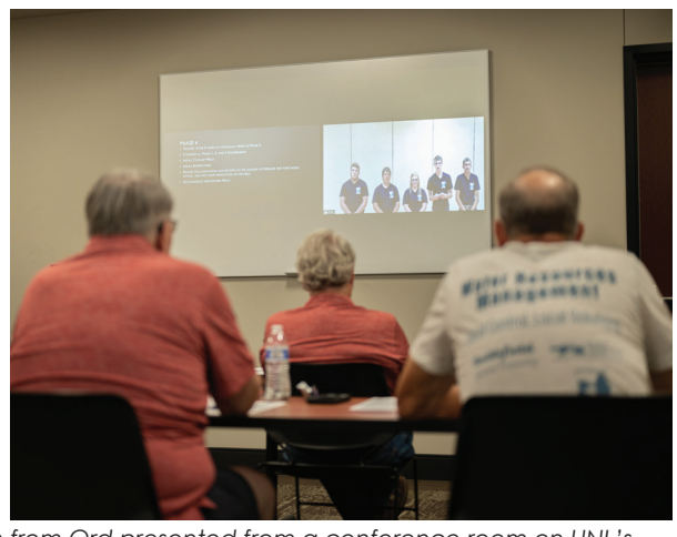
Nebraska's NCF-Envirothon team from Ord presented from a conference room on UNL's East Campus, which was live streamed to a panel of judges at UNL's Innovation Campus. There were 41 teams from across the globe giving presentations on water quality.