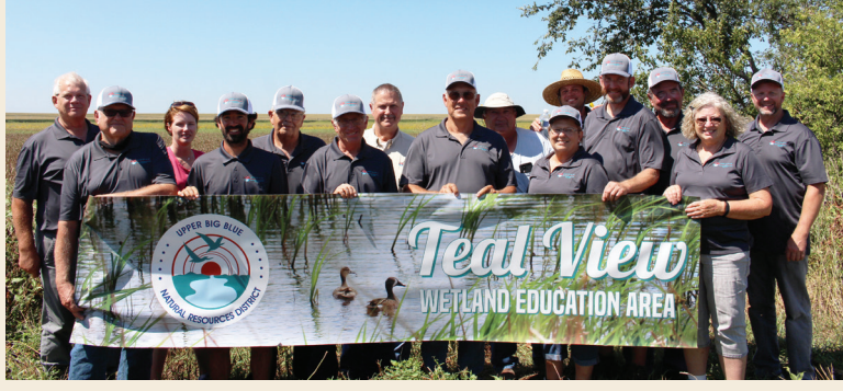
Upper Big Blue NRD recently took over a 39-acre property near Hampton called Teal View Wetland Education Area, which is still being restored. The Upper Big Blue NRD is partnering with other agencies to protect this spot and use it to educate the public on the importance of wetlands in Nebraska. The Teal View property was purchased through the Ducks Unlimited revolving lands program, which takes ownership of properties temporarily while they are being restored, then gives them to entities like the NRDs to manage for public benefit or sells them to private owners who will maintain them as wetlands.