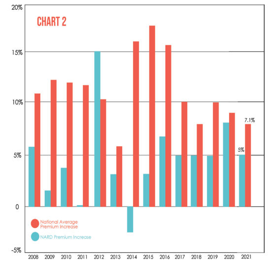
Chart 2: Shows the NARD annual premium increase (percent) compared to the national average premium increase.