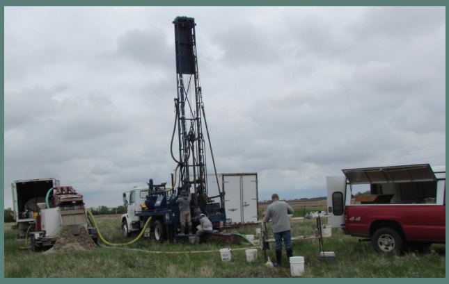
Lower Niobrara NRD expands groundwater monitoring with six new wells using Nebraska Environmental Trust grant funds.