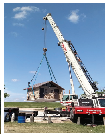
Upper Big Blue NRD recently installed upgraded bathroom facilities at Smith Creek (Utica) and Oxbow Trail (Ulysses) recreation areas.

To find a recreation area near you, visit nranet.org/recreation.