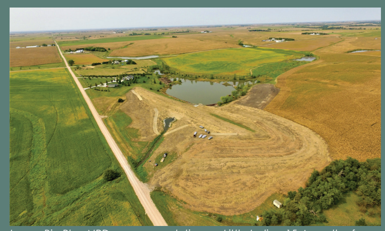
Lower Big Blue NRD nears completion on Little Indian 15-A, north of Pickrell. The project included adding a second emergency spillway, raising the height of the dam and installing a new tube.