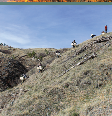
Above: Upper Niobrara White NRD works with the Nebraska Forest Service to reforest the Pine Ridge area after 2006 and 2012 fires. A 15-person crew from Idaho hand plants Ponderosa Pine on the rough terrain. They can plant 20,000 trees in a day. Right: Lower Platte South NRD establishes saltwort (salicornia rubra), an endangered plant species in Nebraska, at the Marsh Wren Saline Wetland in north Lincoln.