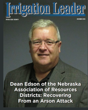
Irrigation Leader, December 2020

working with major corporations to provide funding for NRD programs on sustainability. We were able to direct funding from Pepsi-Frito Lay and the Illinois Corn Board to the Central Platte NRD to promote farming practices that protect the environment. More opportunities exist if we continue to work with ag organizations and corporations.