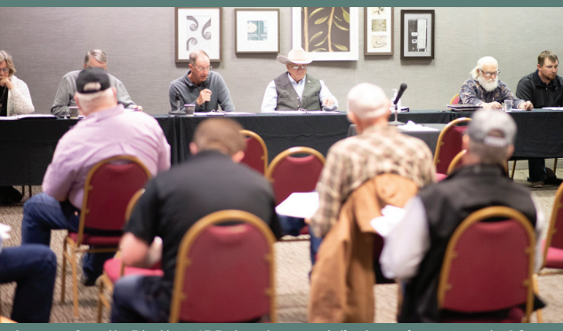
Above: South Platte NRD hosts a public hearing March 18, 2021, to update the district-wide Groundwater Management Area plan rules and regulations.