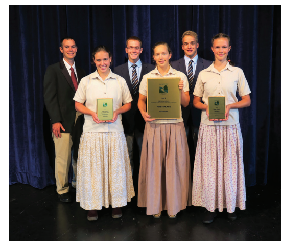
The 2021 NCF-Envirothon champions were New York. The team was from The Mount Academy in Esposus, New York, along the Hudson River.