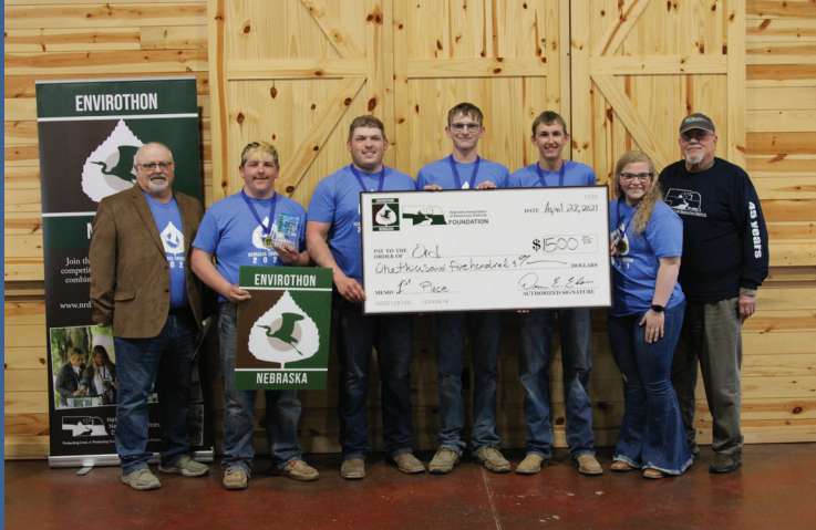
Ord High School took the State Envirothon Championship and represented Nebraska at the NCF-Envirothon July 25-28, 2021.