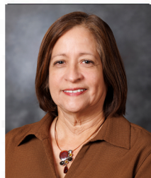
District 5 471-2710