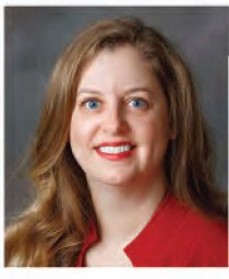
District 10 471-2718