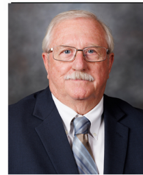
District 17 471-2716