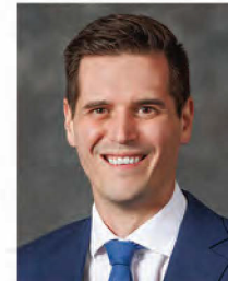
District 20 471-2622