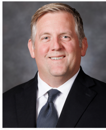
District 27 471-2632