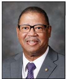
District 3 471-2627