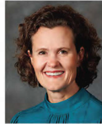
District 24 471-2756