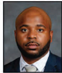
District 11 471-2612