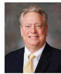
District 19 471-2929