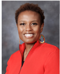
District 13 471-2727