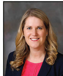
District 25 471-2731