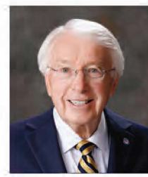
District 12 471-2623