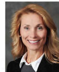
District 18 471-2801