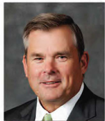
District 4 471-2621