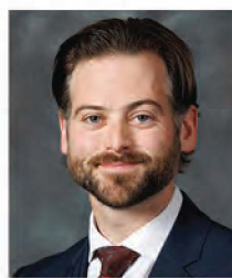
District 26 471-2610