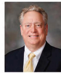
District 19 471-2929