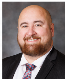
District 7 471-2721