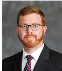
District 9 471-2723