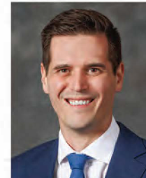
District 20 471-2622