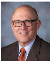
District 14 471-2730