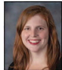
District 6 471-2714