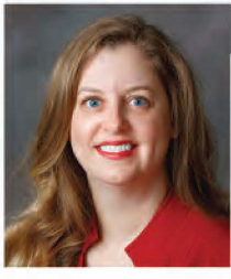
District 10 471-2718