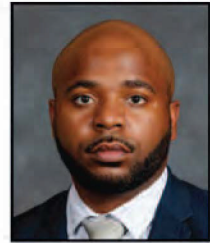
District 11 471-2612