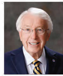
District 12 471-2623