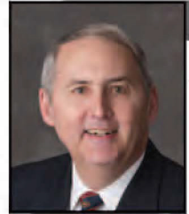
District 2 471-2613