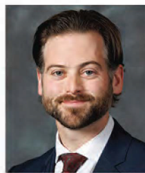
District 26 471-2610