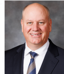
District 23 471-2719