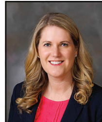
District 25 471-2731