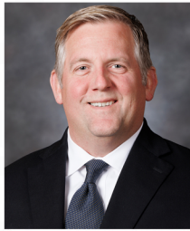
District 27 471-2632