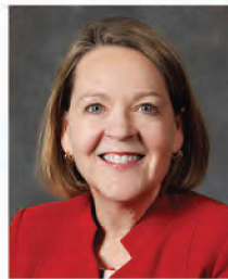
District 28 471-2633