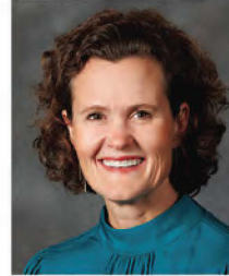
District 24 471-2756