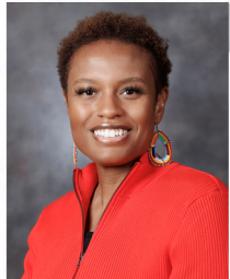
District 13 471-2727