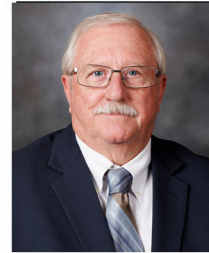
District 17 471-2716