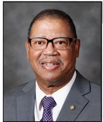
District 3 471-2627