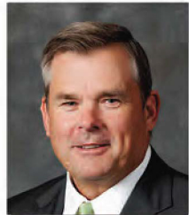
District 4 471-2621