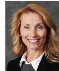
District 18 471-2801