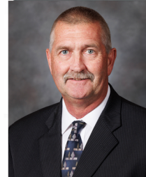
District 15 471-2629