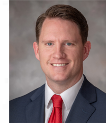
District 16 471-2728