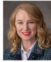
District 8 471-2722