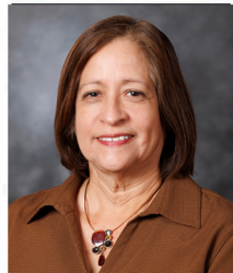
District 5 471-2710