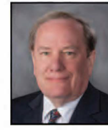
District 22 471-2715