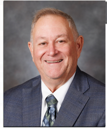
District 1 471-2733