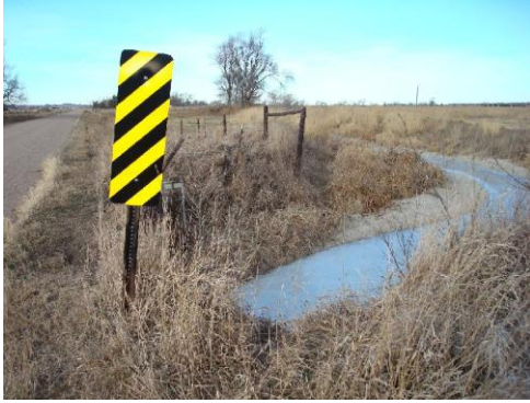
(Above) The removal of the canal protects lives, saves the county dollars and improves roads through reduced maintenance costs while removing bridges and other hazards to drivers within the road right-of-way.