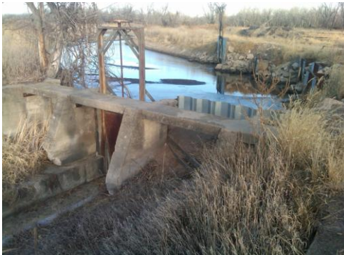
(Above) Diversion gates from the Platte River to the Six Mile Canal. (Right) Map of the Six Mile Canal.