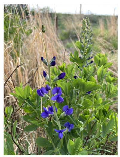
Blue False Indigo

If you find yourself driving down Highway 2 through the Village of Thedford and need to stretch your legs, the NRD invites you to check out the Fire Hall Arboretum. It is located north of the highway behind the Thedford Fire Hall.