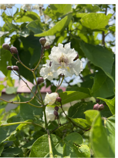
Catalpa in bloom