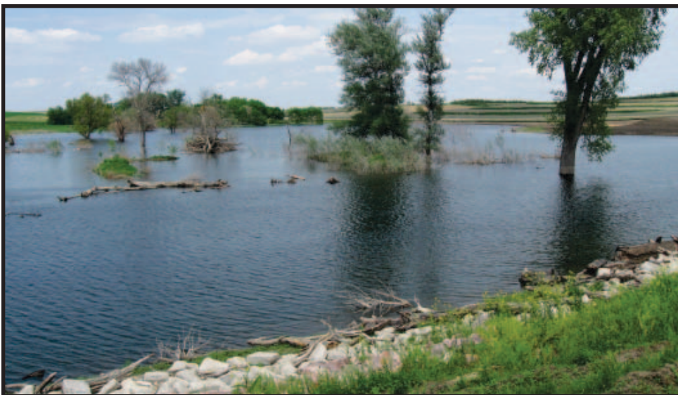
Construction of the flood control dam is complete. The valve is now closed and the lake is starting to fill.

The LENRD plans to open the area to the public in the spring of 2011. In July, public tours/trolley rides of the area will be available during the Colfax County Fair. Contact the LENRD for more information.