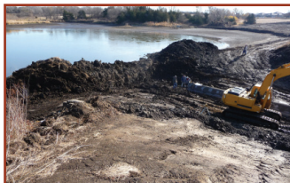
An upgrade of Upper Salt Dam 35-A, north of Hickman, was completed in the spring of 2011.

With help from the Natural Resources Conservation Service, the NRD is participating in a federal program to upgrade old dams so they better protect roads, homes and businesses. Hedgefield Dam, southeast of Hickman and Upper Salt Dam 35-A, just north of Hickman are two examples of dams that have been upgraded under the program.