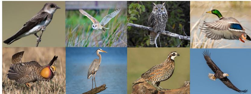
(From top left to right) Eastern Kingbird, Barn Owl, Great-Horned Owl, Mallard, Greater Prairie Chicken, Blue Heron, Bobwhite Quail, Bald Eagle... and many more.