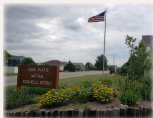
SPNRD headquarters and tree plantings.