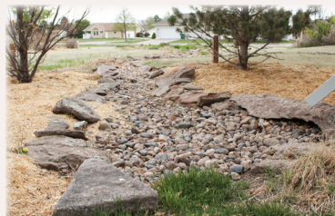
Rain garden in early spring.