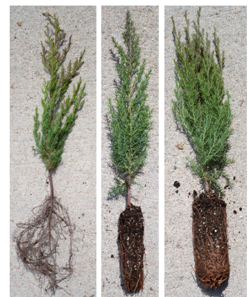
BARE ROOT JUNIPER