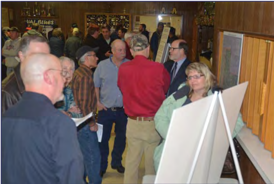
Well owners and others study exhibits and talk with NRD Directors and staff prior to a January 9 public hearing on NRD ground water rules changes.