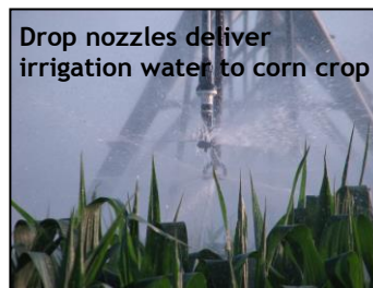
Drop nozzles deliver irrigation water to corn crop

However, only about 10% of those funds came from the UNWNRD's budget. The UNWNRD writes grants and requests dollars from other agencies for cost-share programs. This allows residents to plant trees, put in irrigation flow meters, install drinking water filtration or reverse osmosis systems, properly plug abandoned wells and improve the efficiency of their irrigation systems at reduced cost.