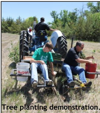
Tree planting demonstration.

To encourage tree planting for conservation, the UNWNRD makes low-cost tree and shrub seedlings available to landowners, in addition to weed barrier and planting services. Within the past year, over 85,000 trees and shrubs were distributed through the UNWNRD's tree program for livestock and homestead protection, soil conservation, wildlife habitat, water conservation and for aesthetic value. Because the tree program is such a large source of the UNWNRD's revenue, the District is able to keep its tax request to a minimum.