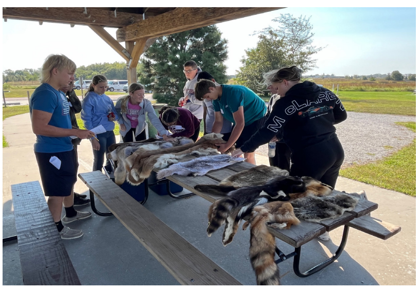
Above: Students learn how to identify wildlife pelts with Nebraska Game & Parks during the Envirothon Field Day in Wahoo on Sept. 4, 2024.

Envirothon Field Days are generally from 9 a.m. to 1 p.m. The above timeline outlines the Envirothon Field Day expectations.