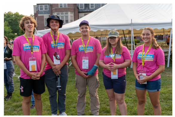
Left: Concordia Lutheran represents Nebraska at the NCF-Envirothon in Geneva, New York. The students had a great oral presentation placing 18th out of 49.

After taking the top spot at the State Envirothon, Concordia Lutheran went on to represent Nebraska at the NCF-Envirothon July 28 to Aug. 3, 2024, at Hobart and William Smith Colleges in Geneva, New York. The NCF-Envirothon included 49 teams from the U.S., Canada, China and Singapore. Top places went to Tennessee (first), New York (second), and Maryland(third). The 2025 NCF-Envirothon will be hosted in Calgary, Alberta, Canada, July 20-26, 2025.