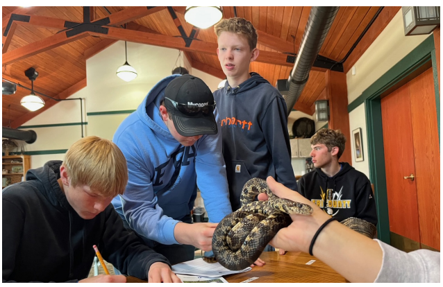
Tri-County students work to identify a snake at the Wildlife station during the State Envirothon at Ponca State Park.

Left: Omaha Zoo Academy students identify a tree at the Forestry station.