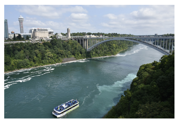
Right: The "Fun Day" during the NCF-Envirothon in New York included a day at Niagara Falls where students took the Maid of the Mist boat tour.