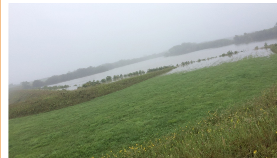
Big Indian 17A- 1 mile east and 1/2 north of Diller is shown with water in the auxiliary spillway

That's the number of dams and grade stabilization structures dotting our district. Flood control structures may easily go unnoticed across the landscape. But after a heavy rain event, like what was recently experienced in southeast Nebraska, these structures spring into action. They capture rushing flood water and hold the water back allowing it to be slowly released downstream. Slowing the water down and allowing it to be gradually released reduces damage to roads, bridges, fences, cropland and other property. If you have a favorite fishing hole in our district, the odds are fairly good that it's an NRD maintained structure. Stop to think about the ponds you drive by on your way to work.... Again, odds are that is one of the 276 sites. Imagine for a moment where all that water would go if not for these storage areas. That's called flood control and its one of the biggest responsibilities of NRD's across the state. Its why we say we're Protecting People, Protecting Property, and Protecting the Future.... And its why the Lower Big Blue is known as the Watershed Capital of Nebraska.